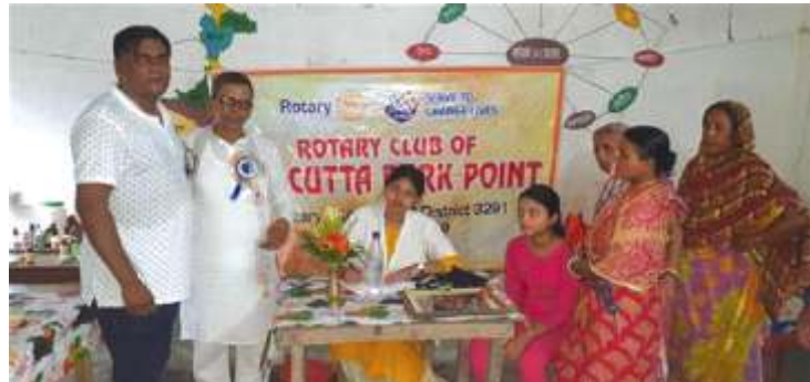
Conducted Medical Camp for the Health Check up of Villagers