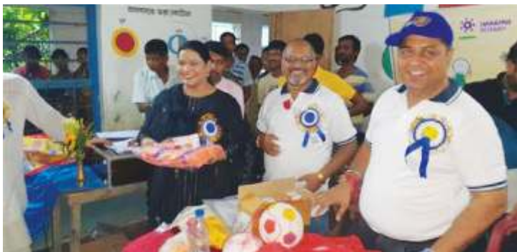
Distributed 40 Nos. LED Lamp to the Villagers