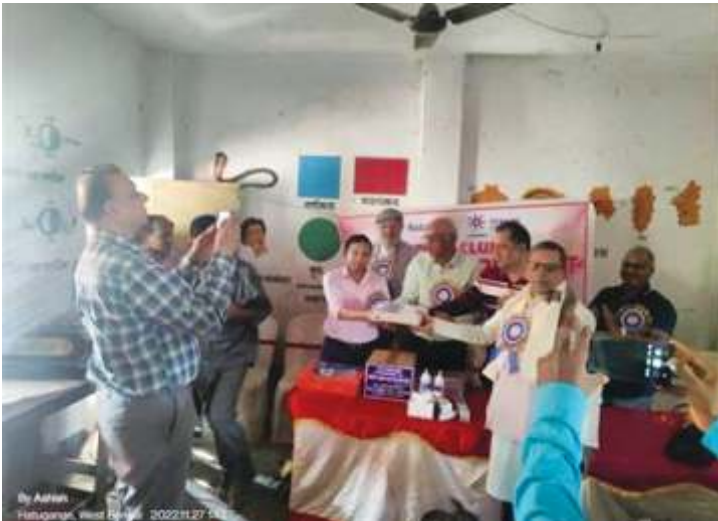
Started Medical Unit at RCC Heliagachi