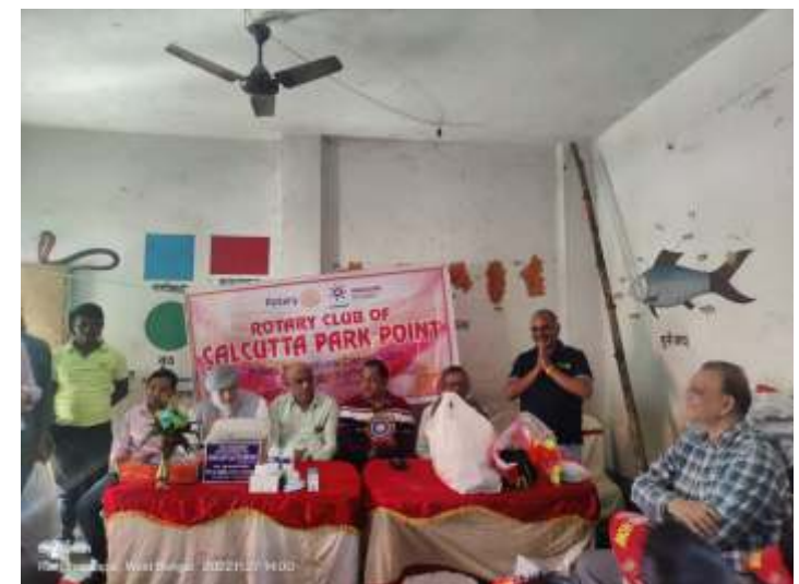
Donating EGC Machine, Blood Glucometer, Weight machine, Height machine & Oxymeter at RCC Heliagachi.