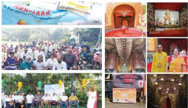
Sports Day for Specially Abled Children