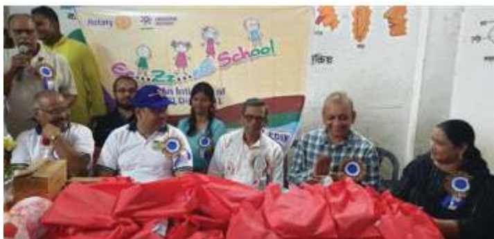
Distributon Stationery 60 Students of RCC Heliagachi