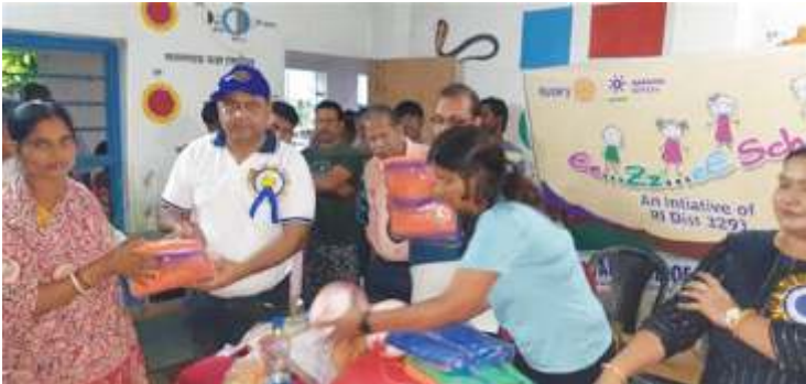
Provided 2 no. of Football for the Participation Sports at RCC