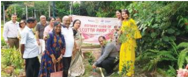
Mega Plantation Project at Calcutta Club