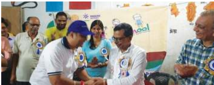
Interest free refundable micro credit loan at RCC Heliagachi