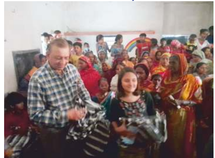
Blanket distribution at RCC Heliagachi