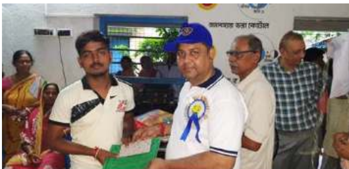
Provided Scholarship to meritorious students of RCC Heliagachi