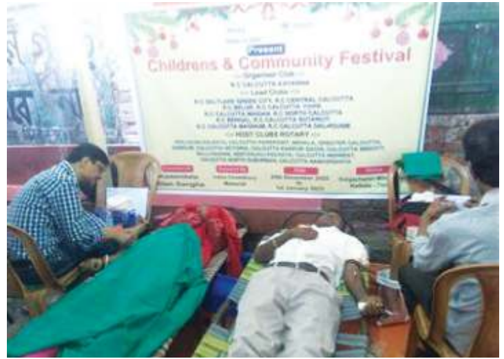
Participation of Host Club as Children & Community Festival