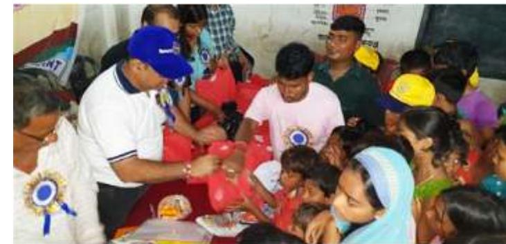
Distribution 50 nos. Mosquito Net to the Villagers of RCC Heliagachi