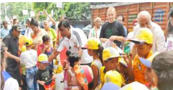
Distribution of Food Packets to Needy Children