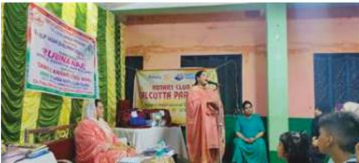
Skill Development Program for adolescent girls