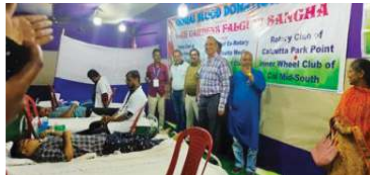
Participated at Co host at Blood Donation Camp