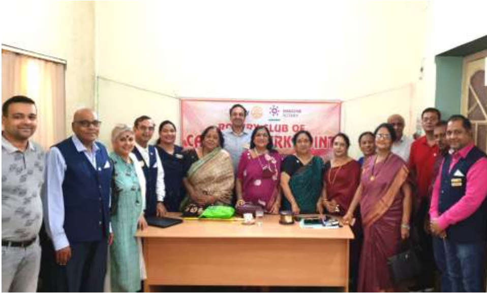
Team Rotary Club of Calcutta Park Point 2022-23

QUATERLY BULLETIN FOR THE PERIOD (OCTOBER - DECEMBER 2022)